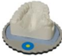
Cast holder, CH-DS3D-V3