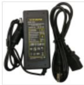
Power supply unit, PSU-DS3D-V3