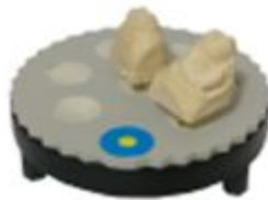
Die holder, DH-DS3D-V3