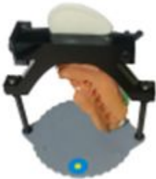
Triple tray holder, TTH-DS3D-V3