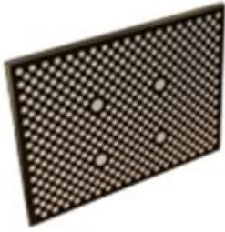
Calibration plate, CP-DS3D-V3