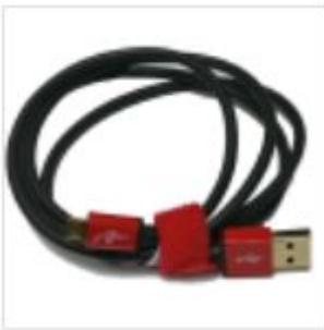
Special USB cable, USB-DS3D-V3