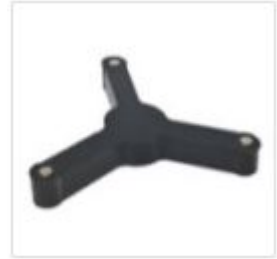
Extender plate, EP-DS3D-V3