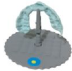
Bite holder, BH-DS3D-V3